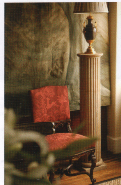
Right: 19TH-CENTURY ITALIAN CHAIR; BRONZE 19TH-CENTURY ITALIAN LAMP; AND ANTIQUE FLUTED PINE COLUMN FROM JOSEPH MINTON ANTIQUES.