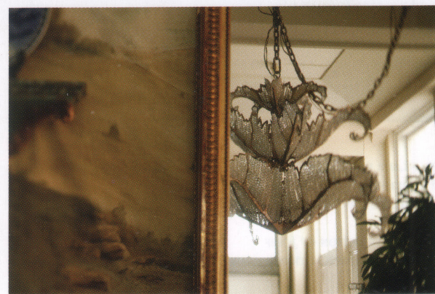
Left: 1920S ART DECO CHANDELIER FROM NIERMANN WEEKS AT HARGETT SHOWROOMS.